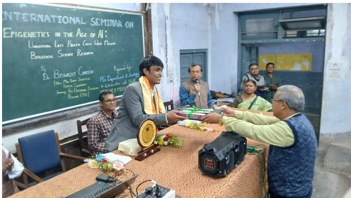
Photo: Felicitation of the Speaker on the day of Seminar (08.02.2025)

Participants: Students of Hooghly Mohsin College